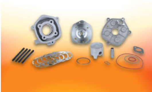
YM312642 - 70cc Cylinder Kit