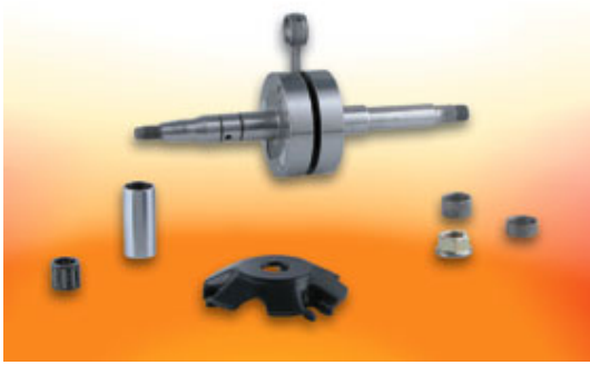
YM532810 - Competition Crank