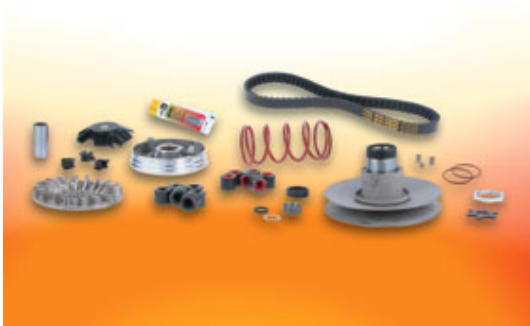
YM612811 - Over-Range Gear up Kit

The “Newest Generation of Disk Brakes”. Light, non corrosive, non-warping, anti-stress. Studied for prolonged use in all weather conditions and types of terrain. The “WHOOOP DISCS” were exposed to numerous tests during competitions, giving Malossi technicians an opportunity to fine-tune the disk brakes for various scooters. The “WHOOOP DISC” paired with Malossi BRAKE PADS guarantee a progressive and secure braking even under extreme conditions.